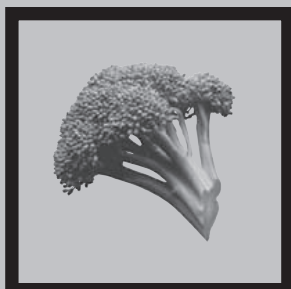
Non-organic ingredient found in organic veggie burrito at last Cheese show.