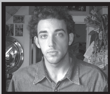
Local guy phucking hates it when his roommate spells things with a ph to show shes a huge Phish Phan.