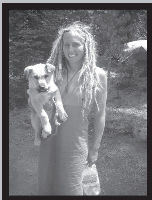
Local hippie claims, "I'm not a hippie."